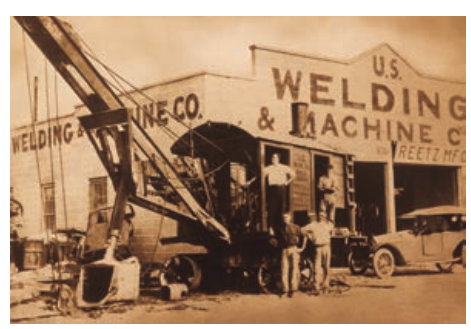
Original Plant - 1916